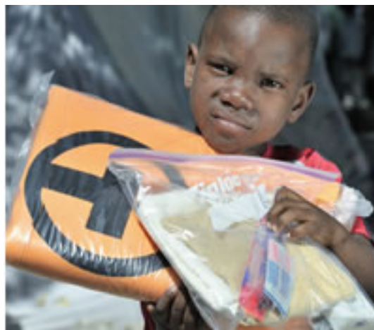
A young survivor of Haiti's earthquake cradles a blanket and hygiene kit he received from Church World Service. He is part of a group of disabled Haitians who are receiving special attention from CWS and its partners.